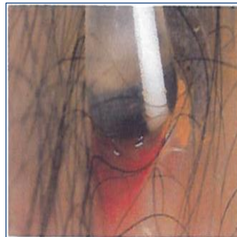
Infected exit. Slightly exuberant granulation tissue in the sinus.