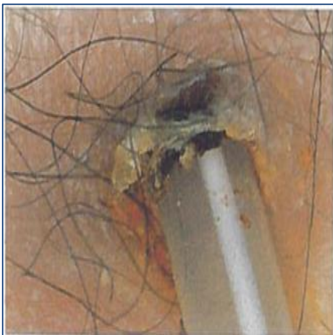
Chronic infection. Large crust with scab and partially dried drainage.